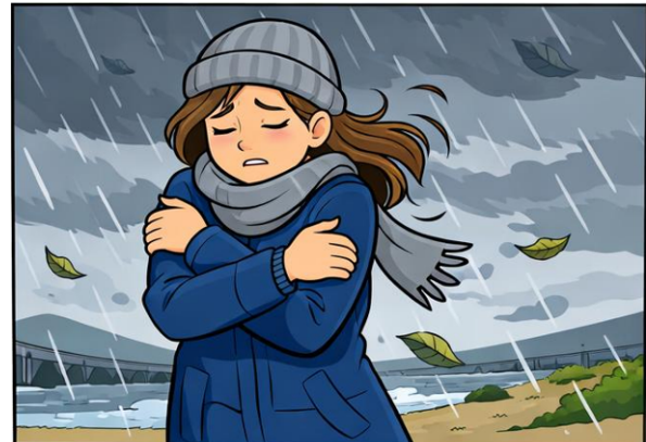
When I arrive at my destination the weather _____ and I _____.