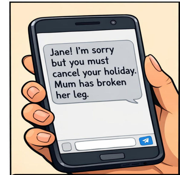
I'm sure I _____ and I _____ need to cancel my holiday.