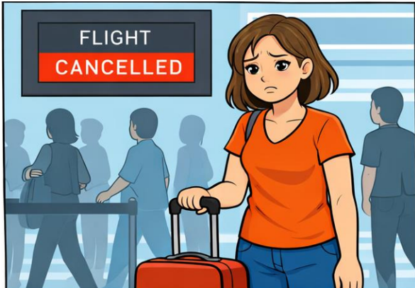
When I get to the airport, my flight _____.