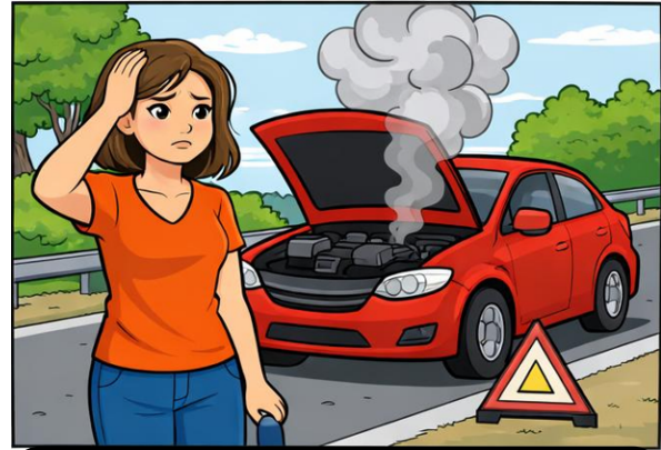
When I drive to the airport, my car _____.