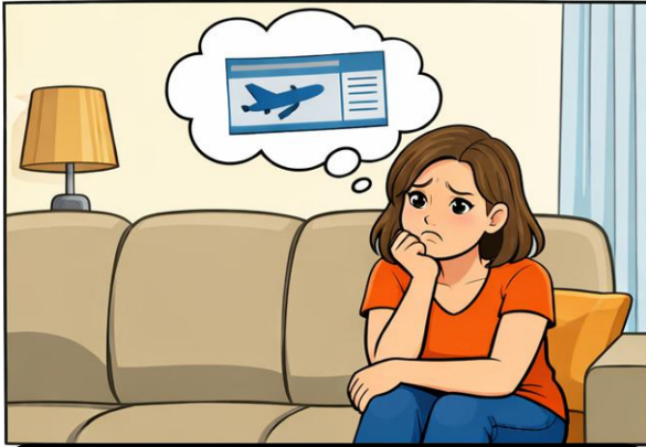
I really don't know why I booked this holiday. I'm sure I won't have a good time.

This is Ms Pessimist who always worries about not getting things right. She's going to go on holiday, but as usual she is worrying about different problems she thinks she will have. Look at the comic strip and fill the boxes with what she thinks. Use will for predictions.